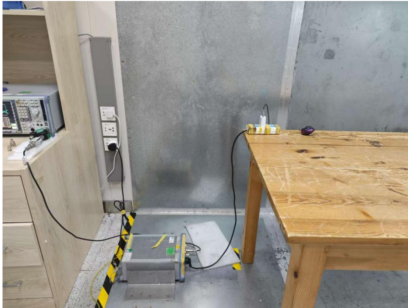
Radiated Emissions From 30M-1GHz