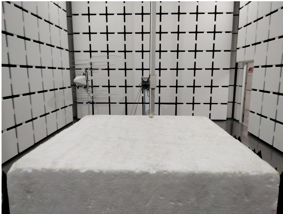
Radiated Spurious Emission (below 1GHz)