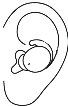
1. place bud in ear