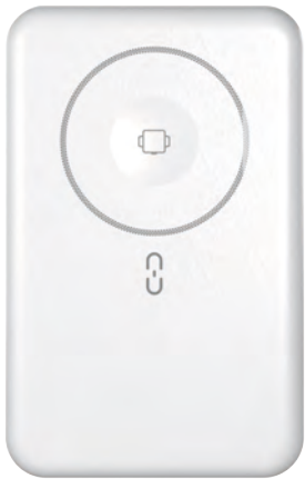
Endless Series Magnetic wireless charging mobile power bank