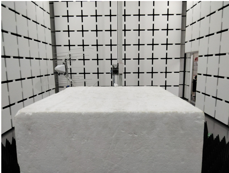
Radiated Spurious Emission (below 1GHz)