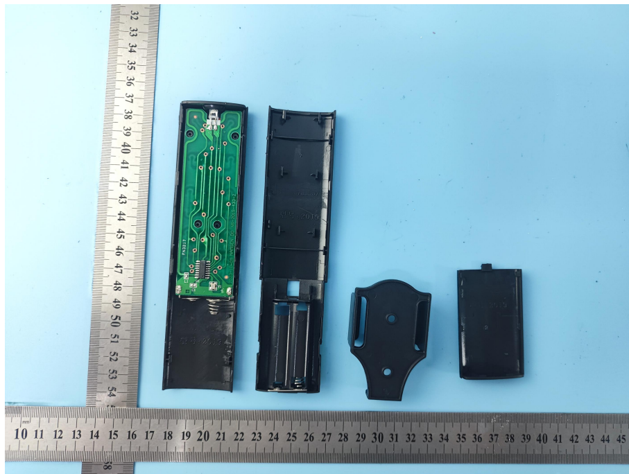
INTERNAL PHOTO OF SAMPLE PCB