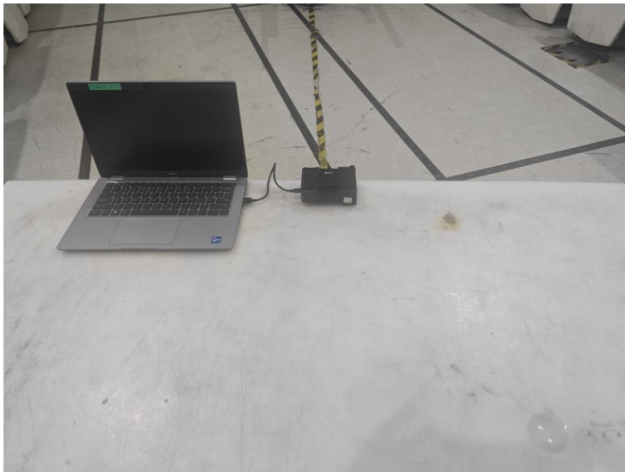
Back View (Below 1GHz)