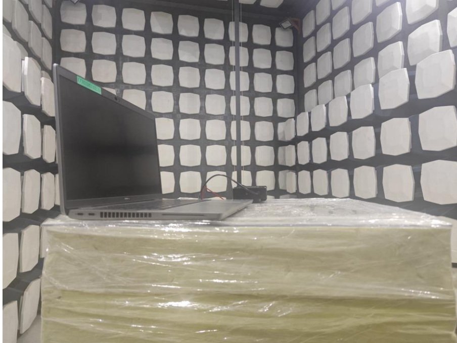
Back View (Above 1GHz)