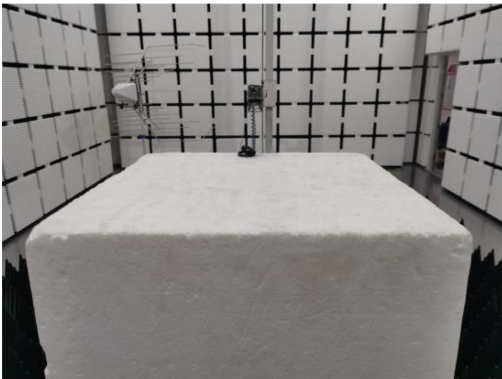
AC Conducted Emission: