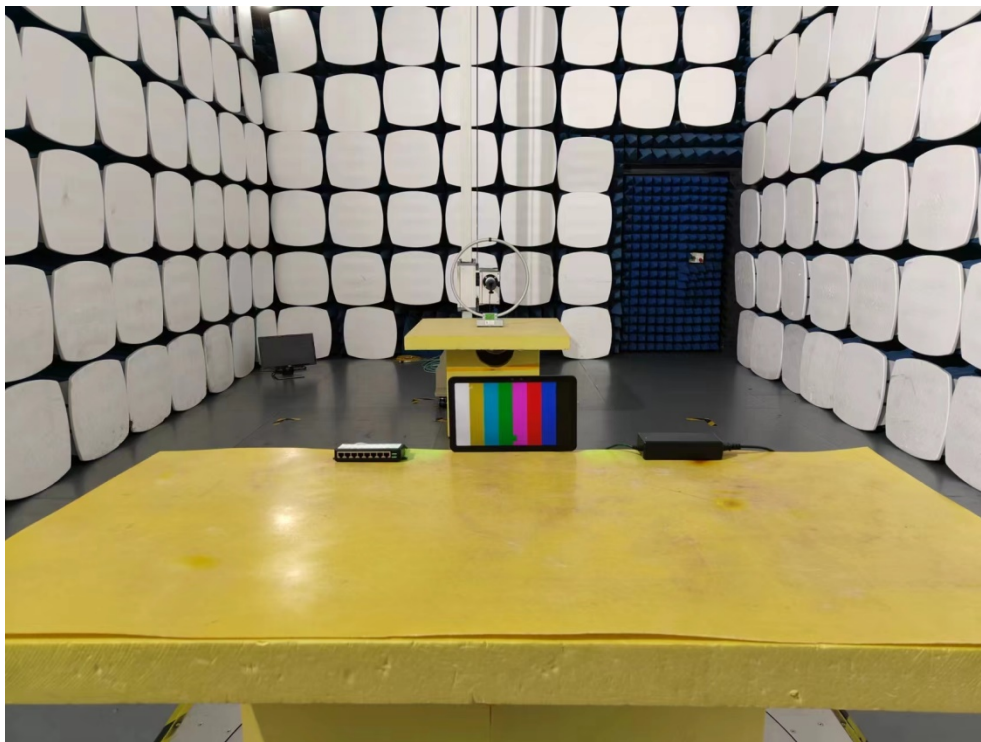
Radiated Spurious Emission, 30MHz - 1GHz