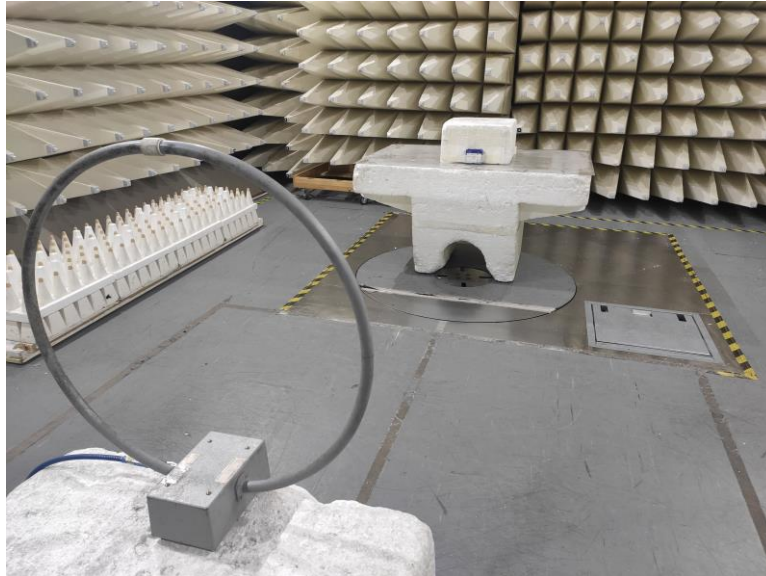
Photograph No.1 Setup for spurious emission field strength measurements in the anechoic chamber below 30 MHz for XRT20229