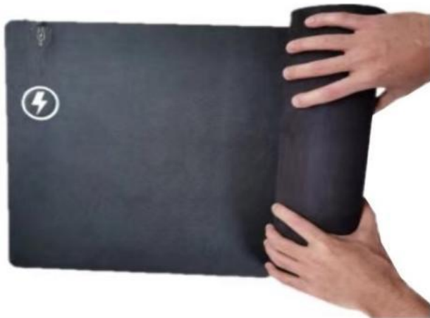
Roll up the edges in reverse way to the direction it curls and put it still for a short while