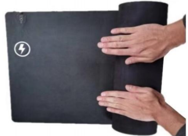
Press slightly on the cylinder according to how severe it curls