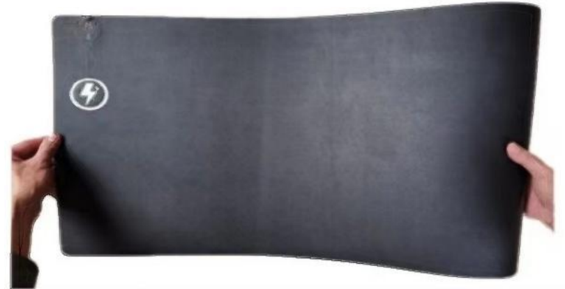
Stretch Your Desk Pad