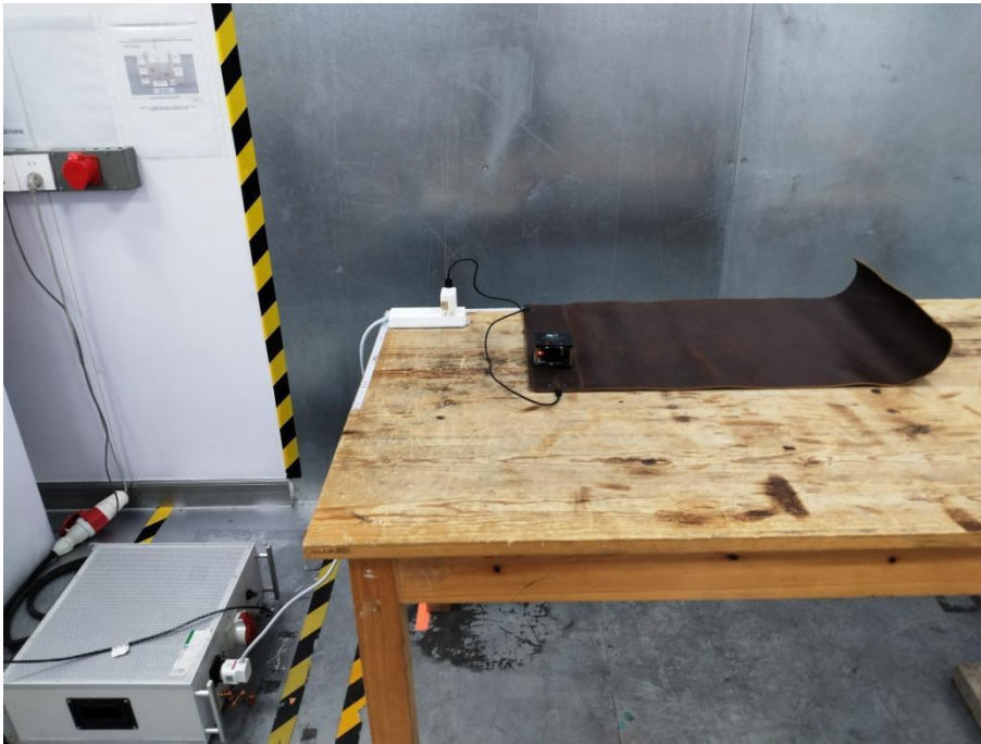
Emissions in frequency bands (below 30MHz)