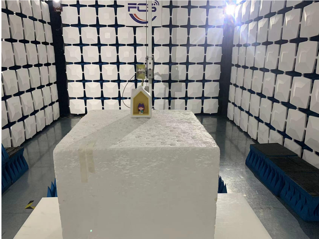
Conducted emission test setup