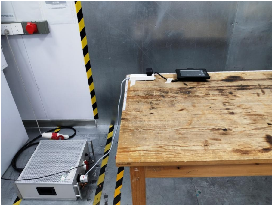
Emissions in frequency bands (below 1GHz)