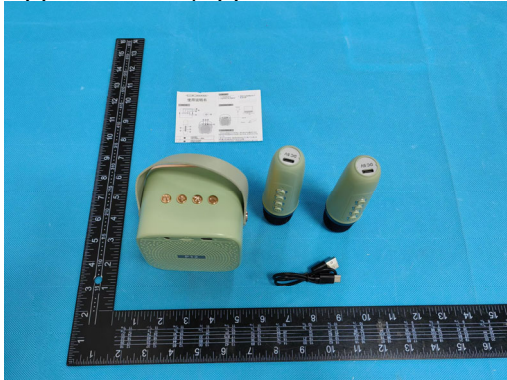
Appearance 4(Applicable to Model :P12)