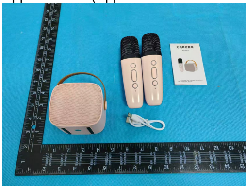
Appearance 7(Applicable to Model :P12)