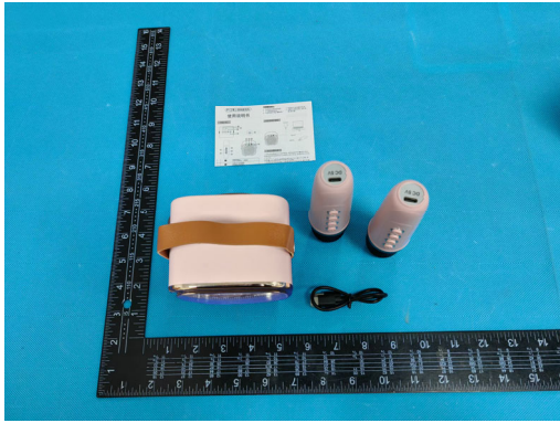
Appearance 5(Applicable to Model :P12)