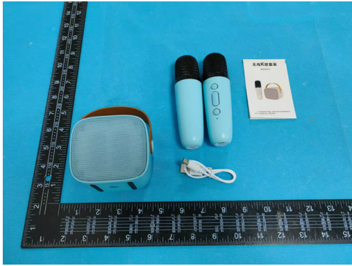
Appearance 8(Applicable to all models)