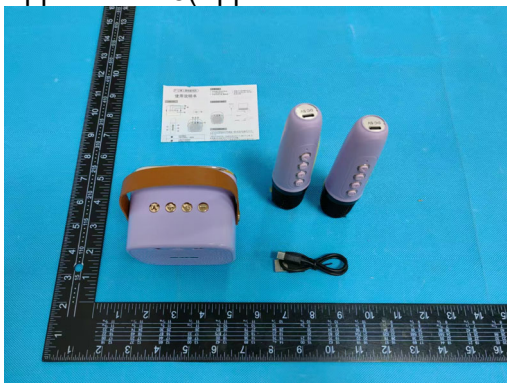
Appearance 6(Applicable to Model :P2)