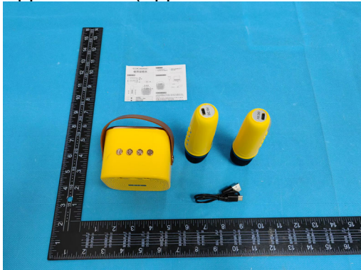
Appearance 3(Applicable to Model :P12)