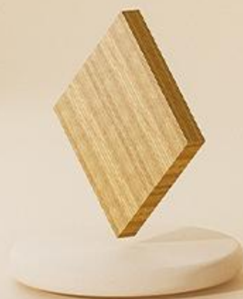
Solid wooden wall

Note: Try to determine the location to be installed before fixing.