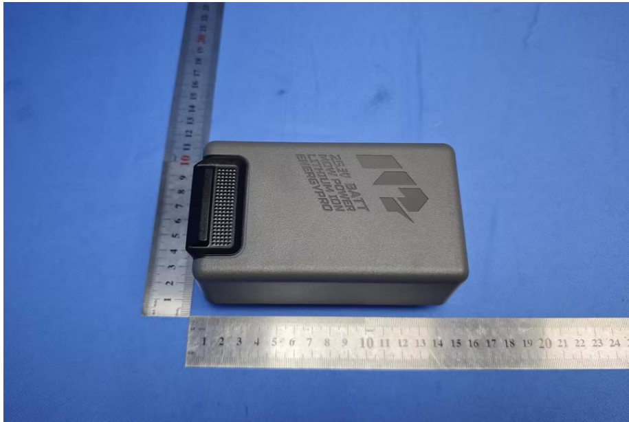
Model No.: 600 with Battery 2