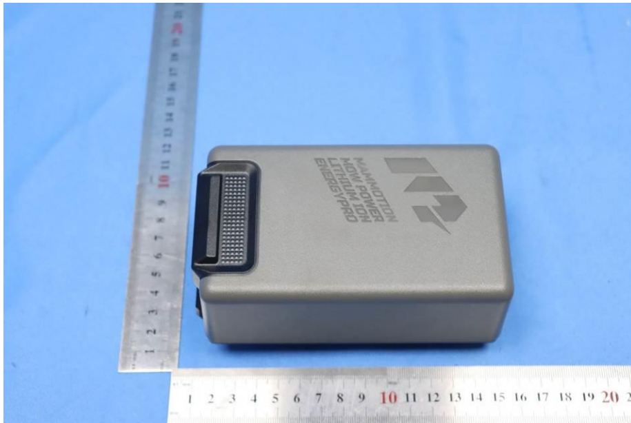
Model No.: 700 with Battery 3