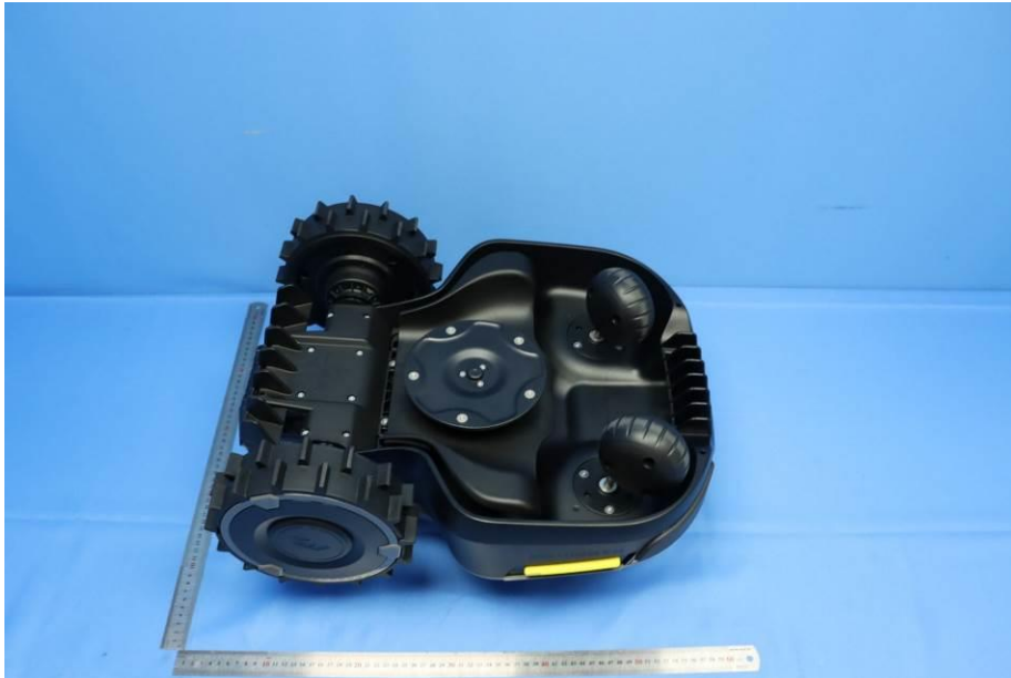
Model No.: 800 with Battery 1