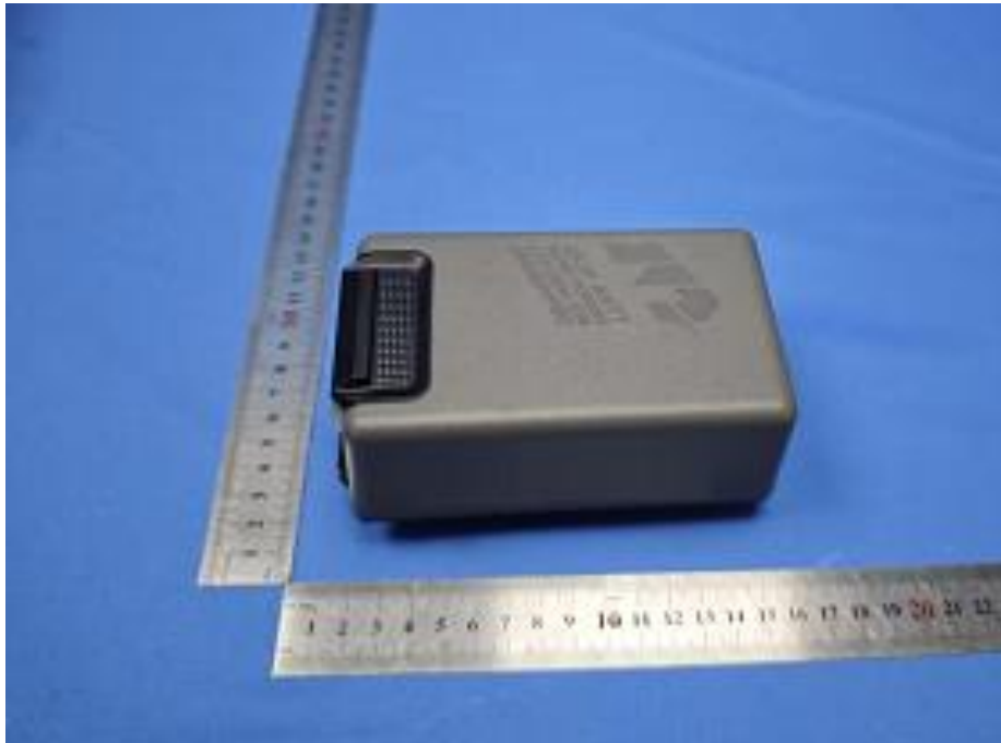
Model No.: 500 with Battery 4