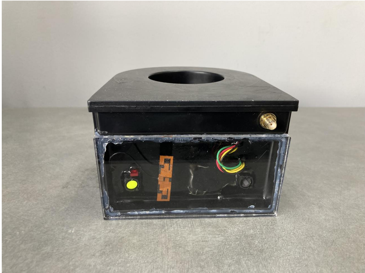
Figure 3. Bottom View

FCC Part 15.247 Certification 2BFVO-CAPMDSEN N/A 24-0113 August 27, 2024 GE Grid Solutions Cap MD