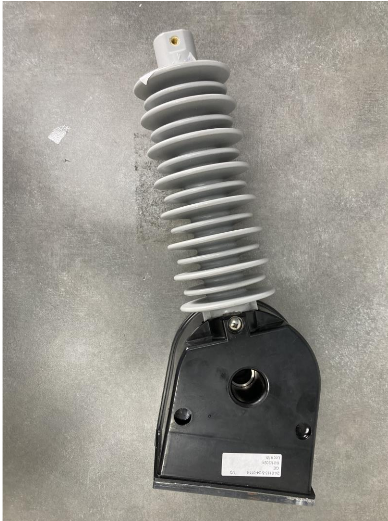
Figure 6. Back View

FCC Part 15.247 Certification 2BFVO-CAPMDSEN N/A 24-0113 August 27, 2024 GE Grid Solutions Cap MD