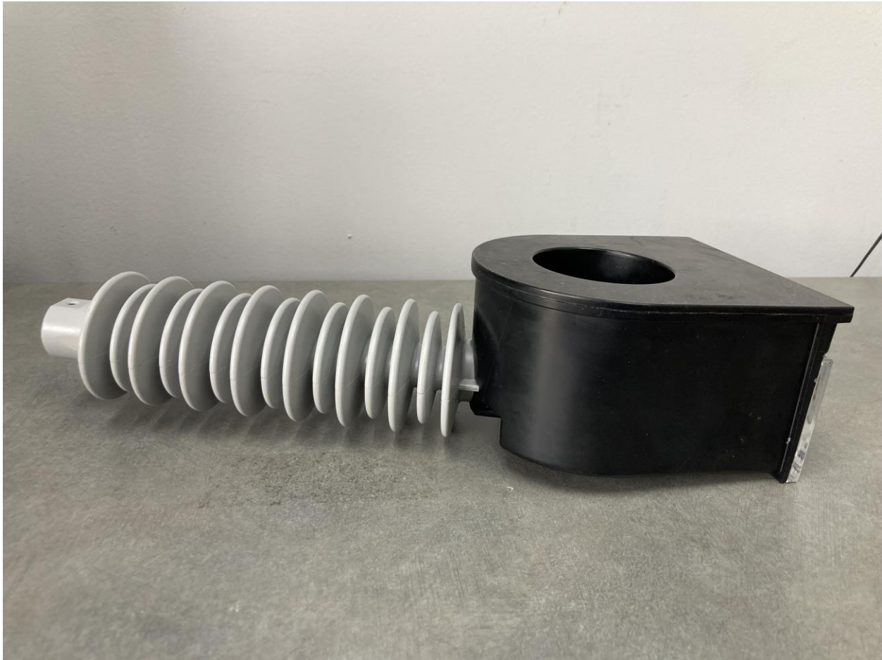
Figure 2. Side 1 View

FCC Part 15.247 Certification 2BFVO-CAPMDSEN N/A 24-0113 August 27, 2024 GE Grid Solutions Cap MD