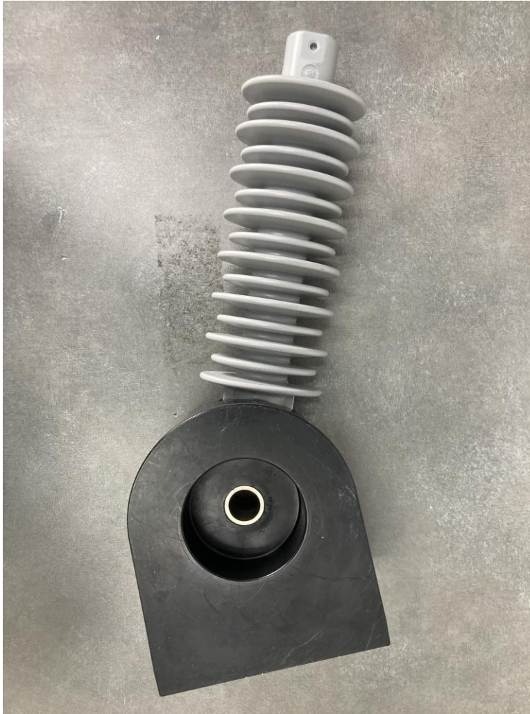
Figure 1. Front View