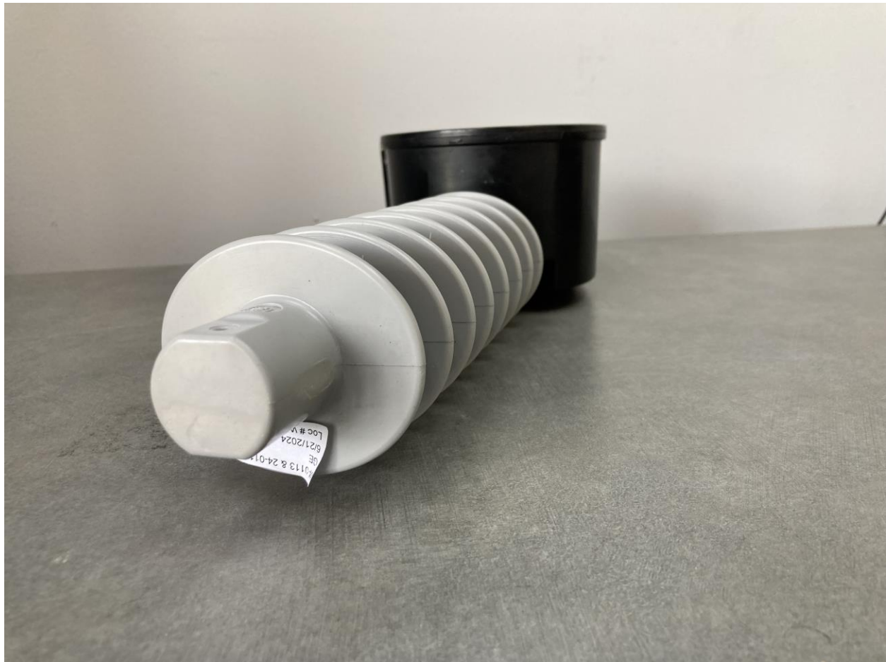
Figure 5. Top View

FCC Part 15.247 Certification 2BFVO-CAPMDSEN N/A 24-0113 August 27, 2024 GE Grid Solutions Cap MD