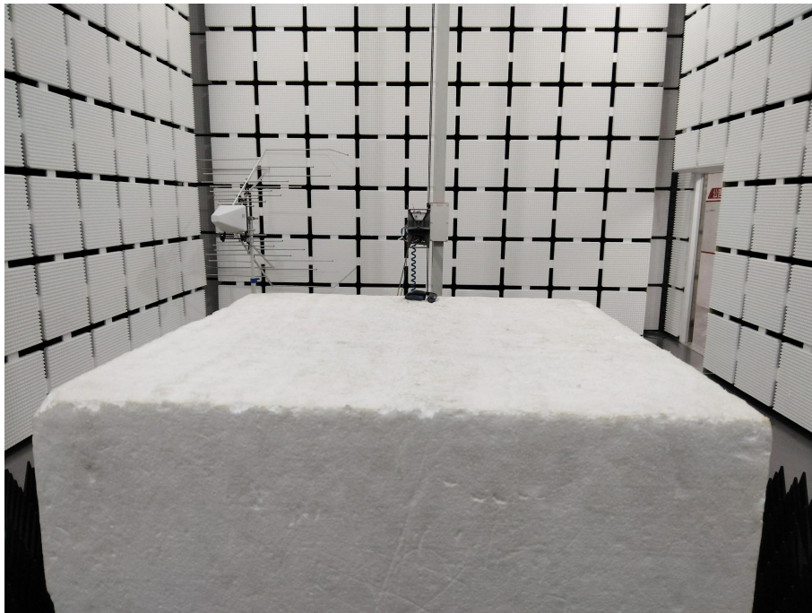
Radiated Spurious Emission (below 1GHz)