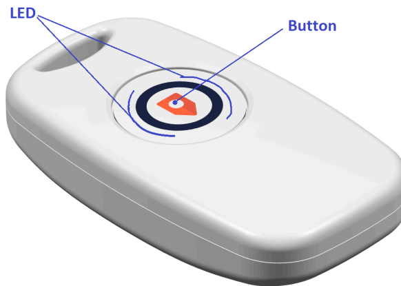
Figure 3. Led and button.