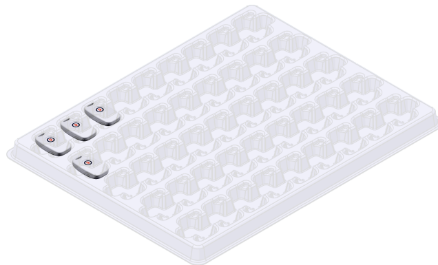
Figure 4. CloudTag devices packing.

CloudTag devices are packed in a cardboard box. A maximum of 45 pcs devices are placed in a single layer. Each layer has its own tray on which to place the tags. Below is the image of the one tray. One cardboard box can contain several trays, so one box can fit several hundred CloudTag devices.