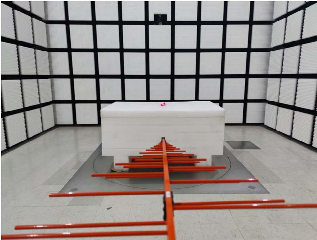
Radiated Emissions Above 1G front View-M1