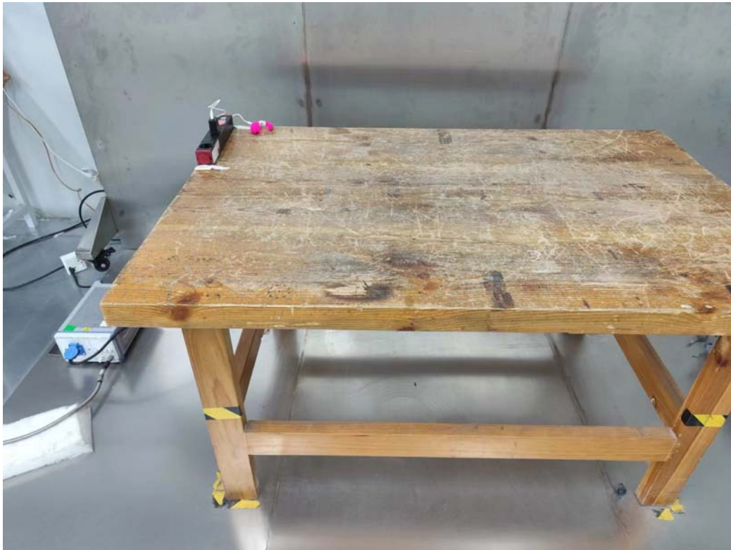
Conducted emissions side View M1