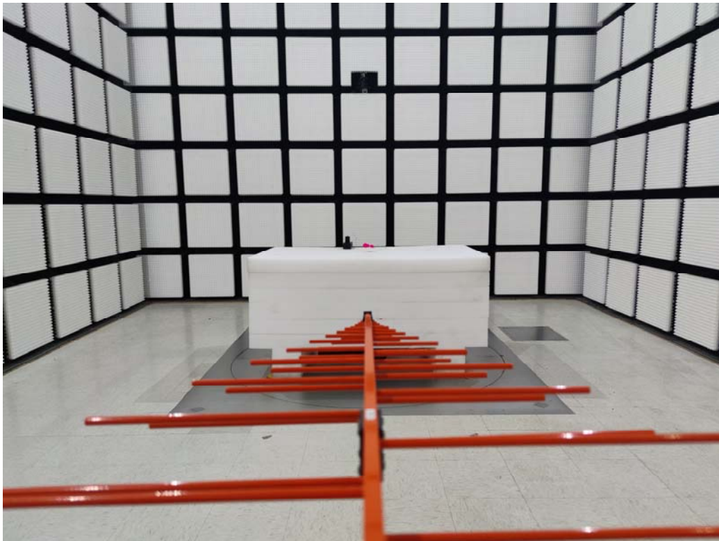
Radiated Emissions Below 1G Rear View-M1