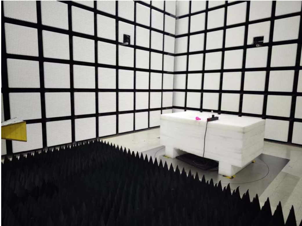
Radiated Emissions Above 1G View M2