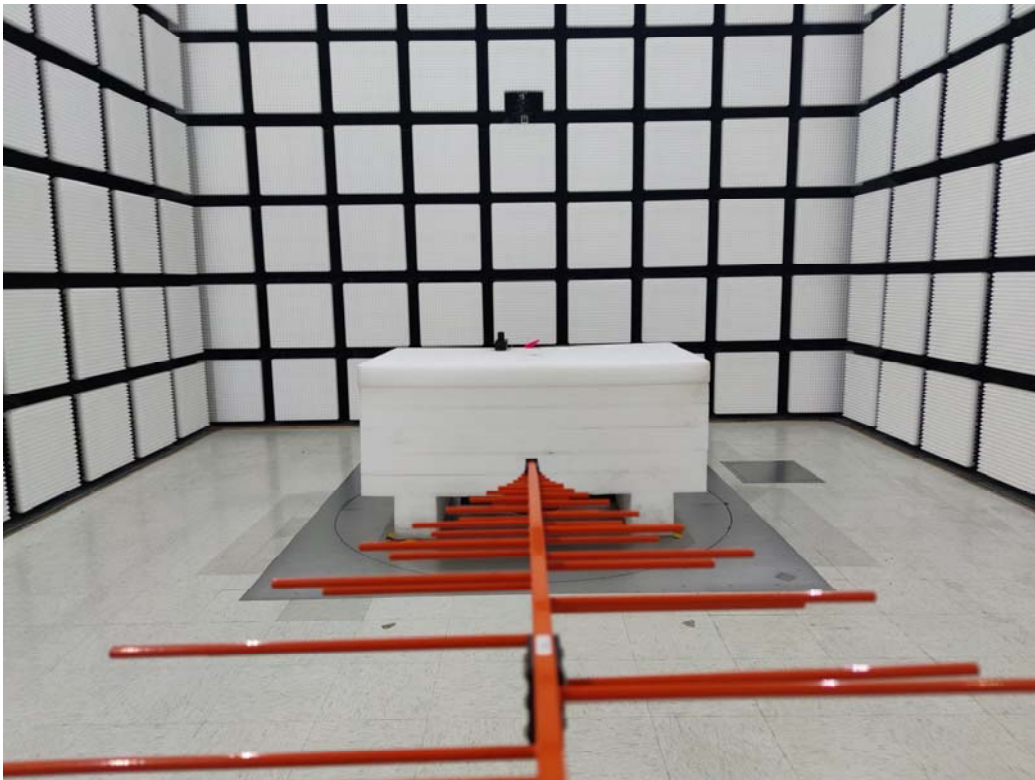
Radiated Emissions Below 1G Rear View M1