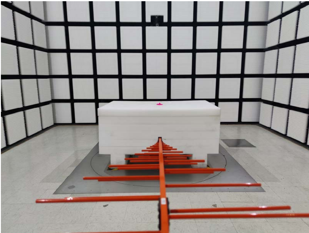
Radiated Emissions Above 1G front View M1