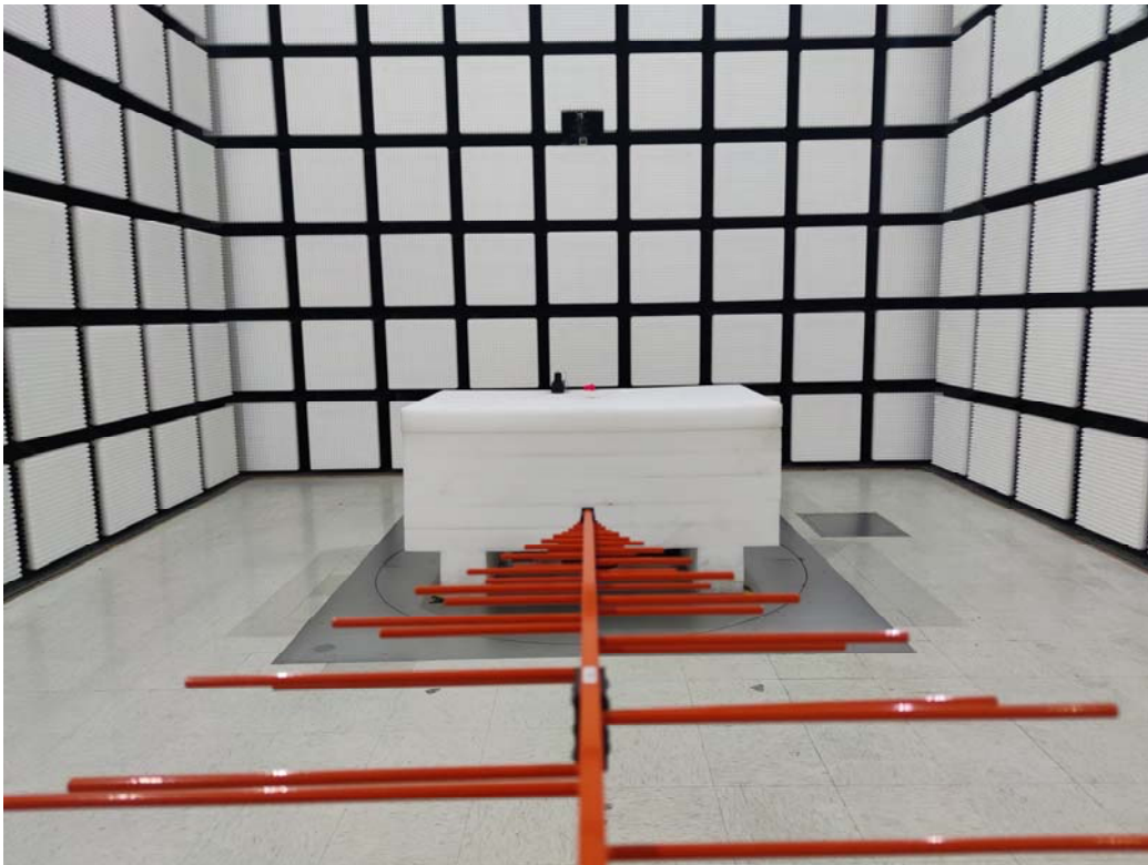
Radiated Emissions Below 1G Rear View M1