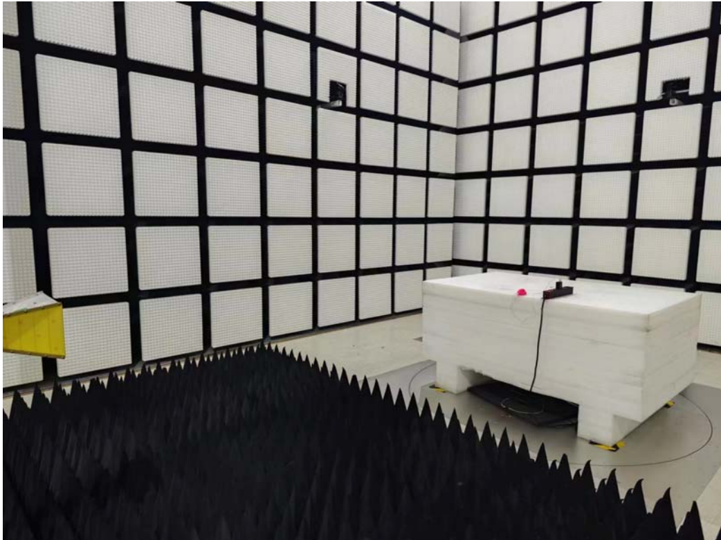
Radiated Emissions Above 1G View M2