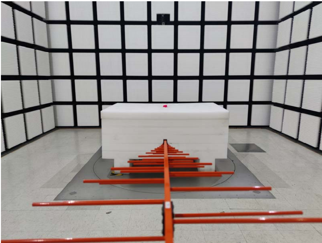
Radiated Emissions Above 1G front View M1