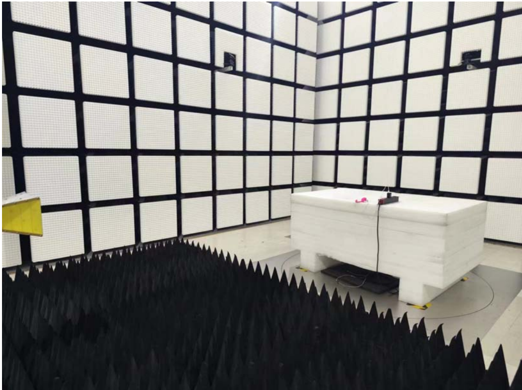
Radiated Emissions Above 1G View M2