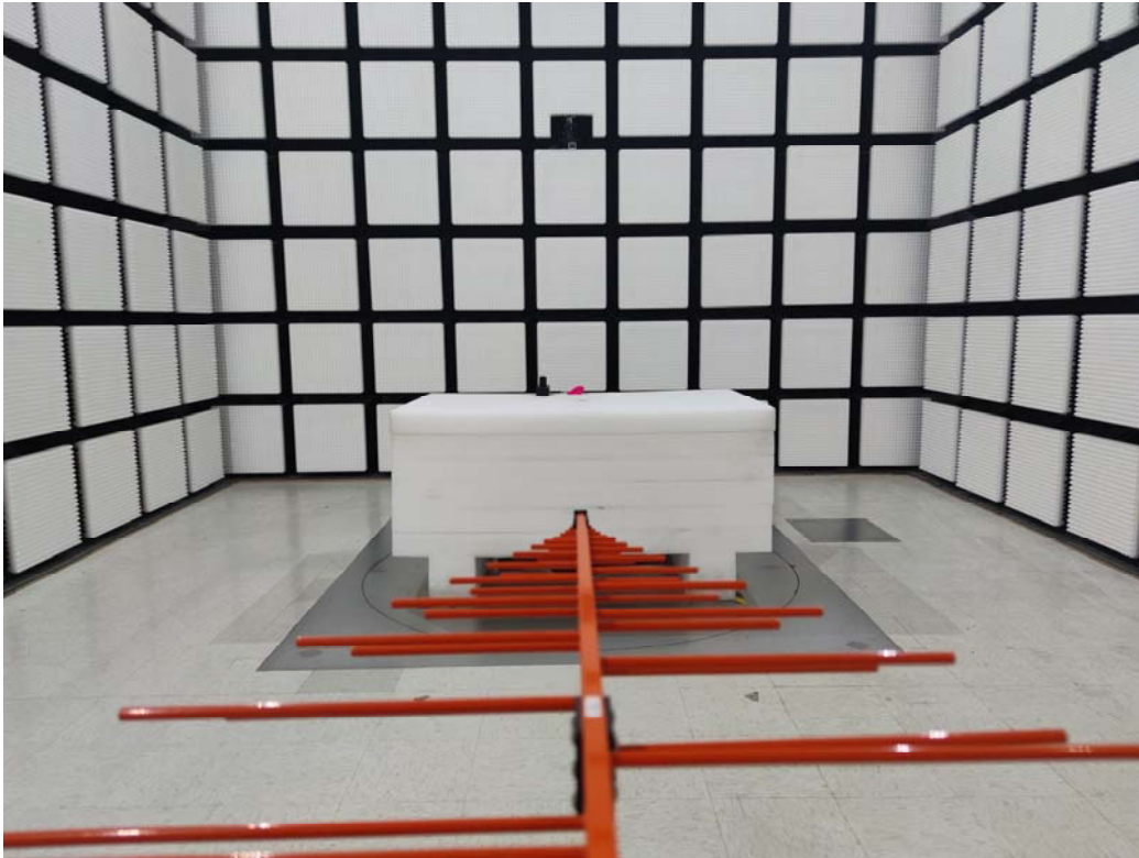
Radiated Emissions Below 1G Rear View M1