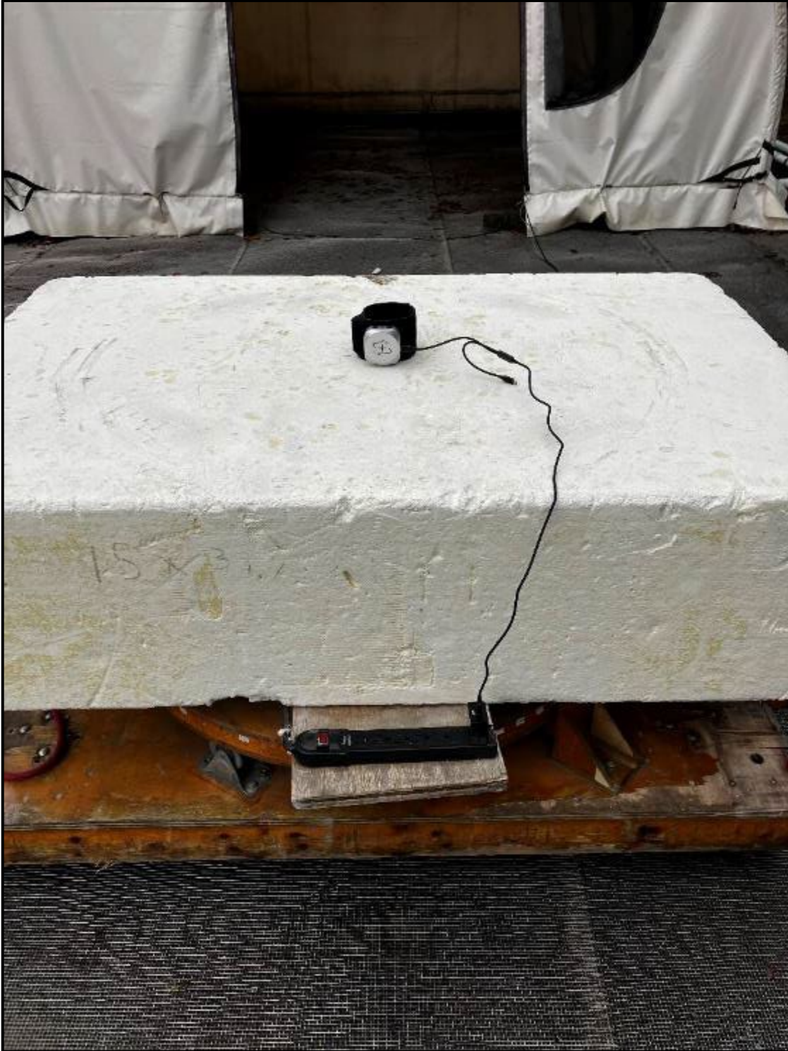
Photograph 1: Front View (Below 1 GHz)