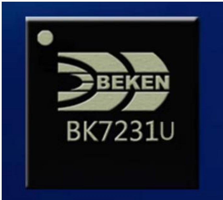
View of Product-25