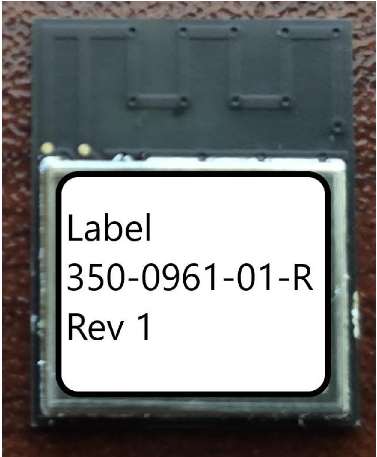
Figure 1: View 1