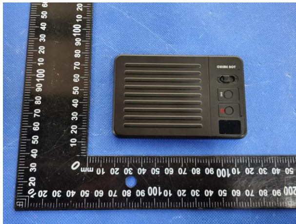
Model Number: OBS-L1