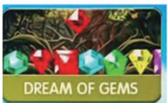
DREAM OF GEMS

Players can freely choose the single or double mode: in the game the pass type is adopted, and the score of the pass is increased incrementally, and the score of the previous level can be accumulated to the next level;the player needs to get the specified score within the limited life value to pass the level;During the game there will be bad eggs from time to time players need to pay attention to avoiding;in the two-player mode it is a cooperative battle through the barriers; Single/double mode: "START" to enter the game; "SELECT" to pause/exit; "A" key to confirm; "B" key to return; Up,down, left,and right button options;horizontal grip handle;in the game:up,down,left,and right buttons to control the direction; "A" key to play chess Press "R" to back main menu in any situation