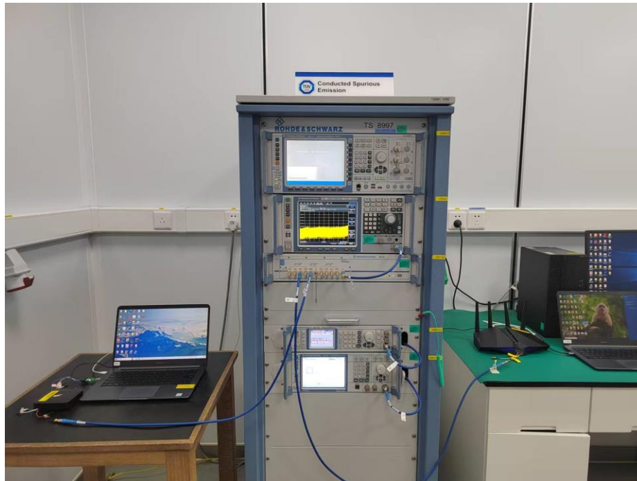
DFS Test Setup