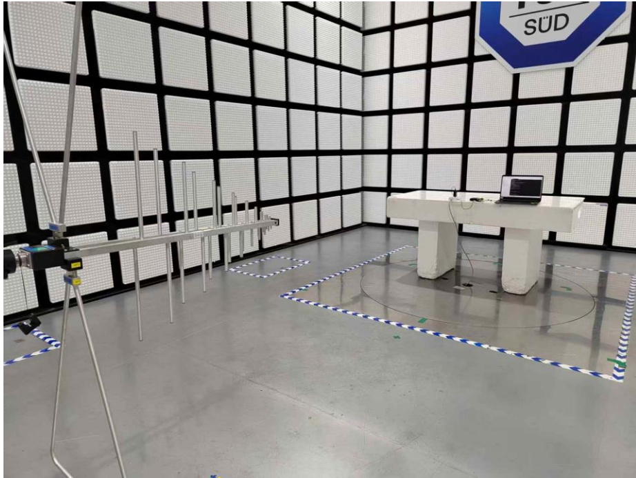
Radiated Spurious Emission 30-1000MHz