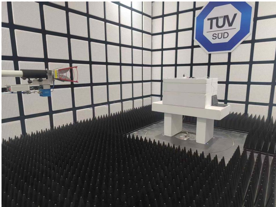
Radiated Spurious Emission Above 1GHz