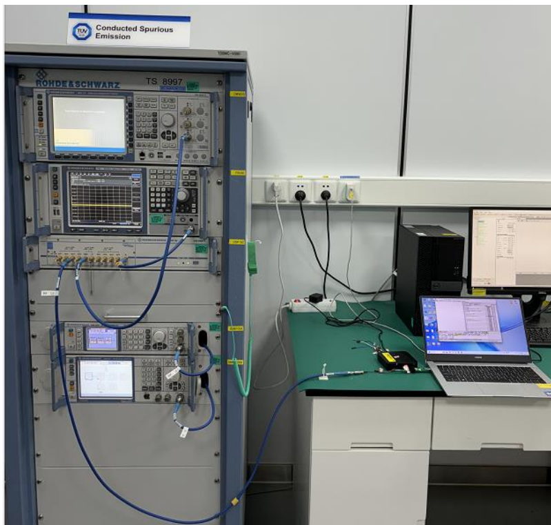
RF Conducted Test Setup