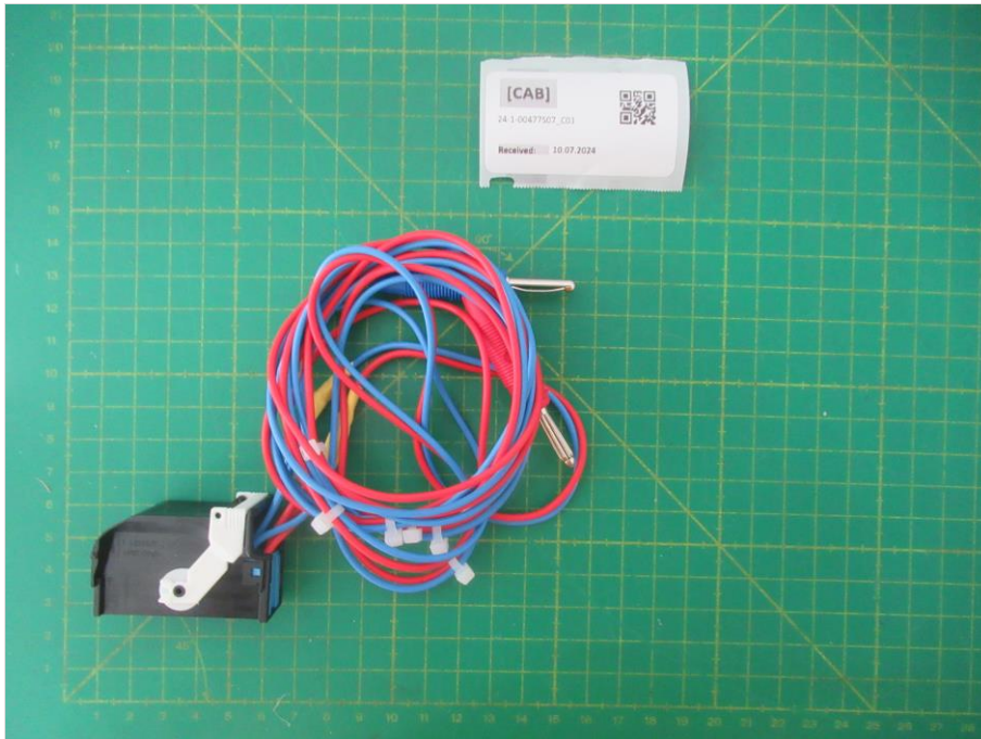
Photograph 5: CAB 1