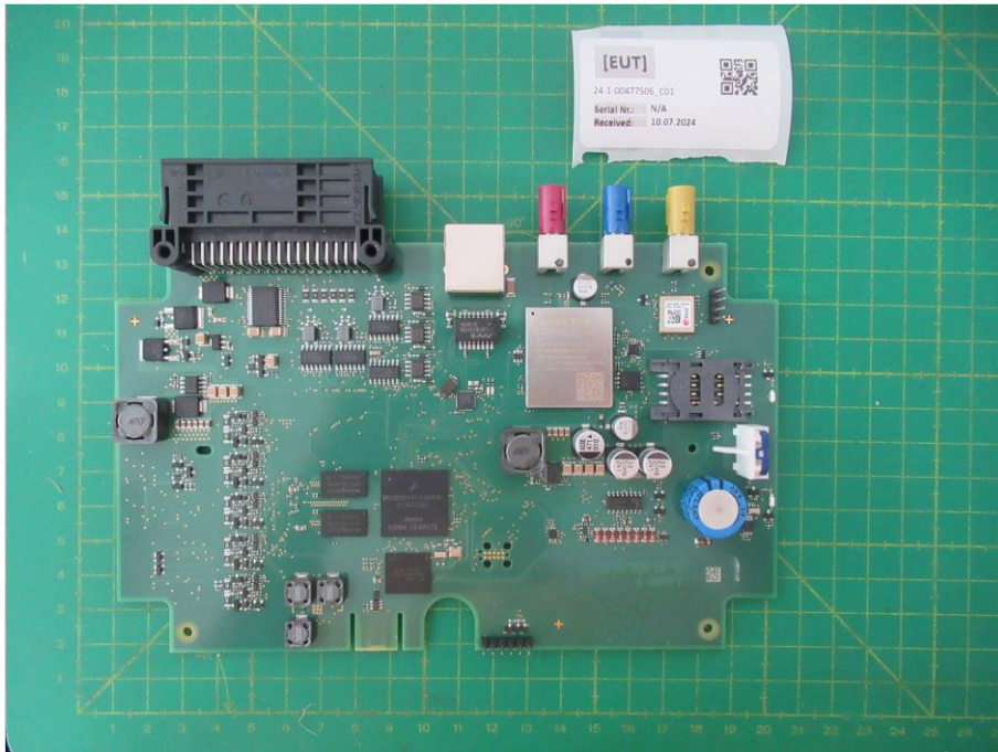
Photograph 3: EUT 3_Top side view