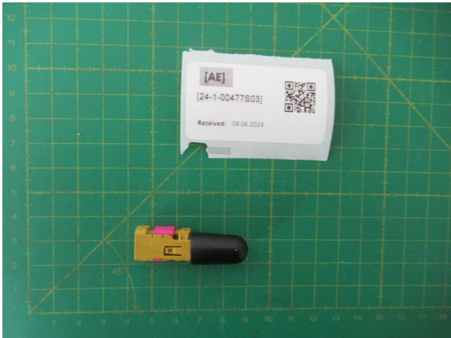
Photograph 4: AE 1