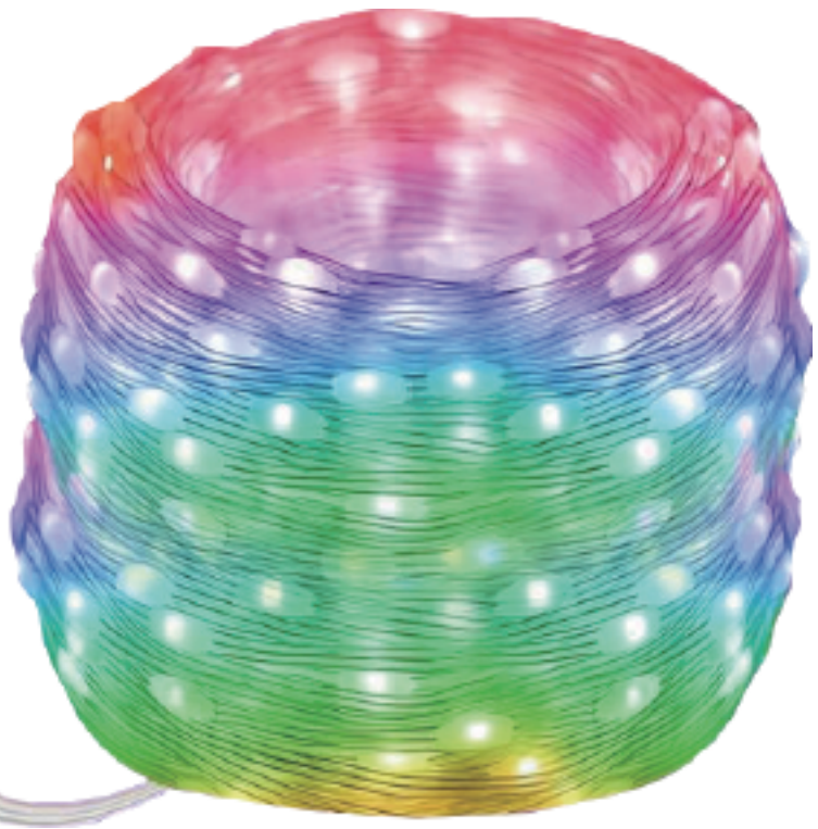
LED light string IP65 waterproof