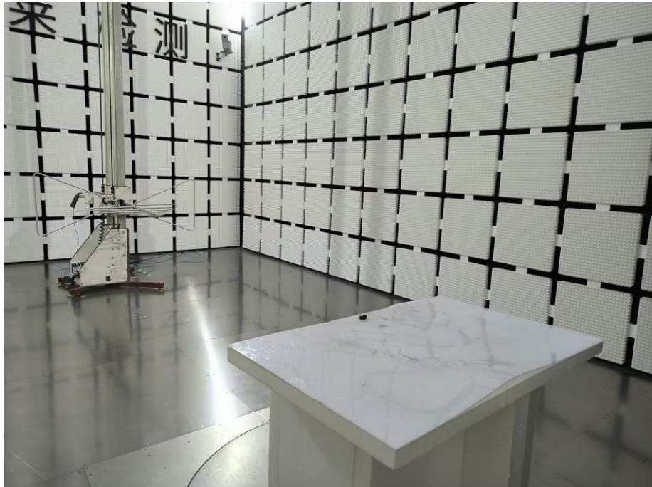
Radiated Measurement Photos