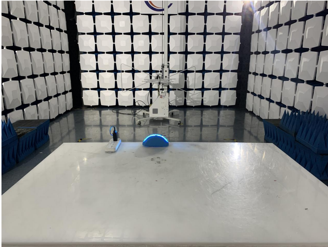
Below 1GHz for radiated emission test setup