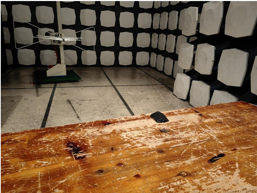
30 MHz to 1 GHz Radiated Spurious Emissions