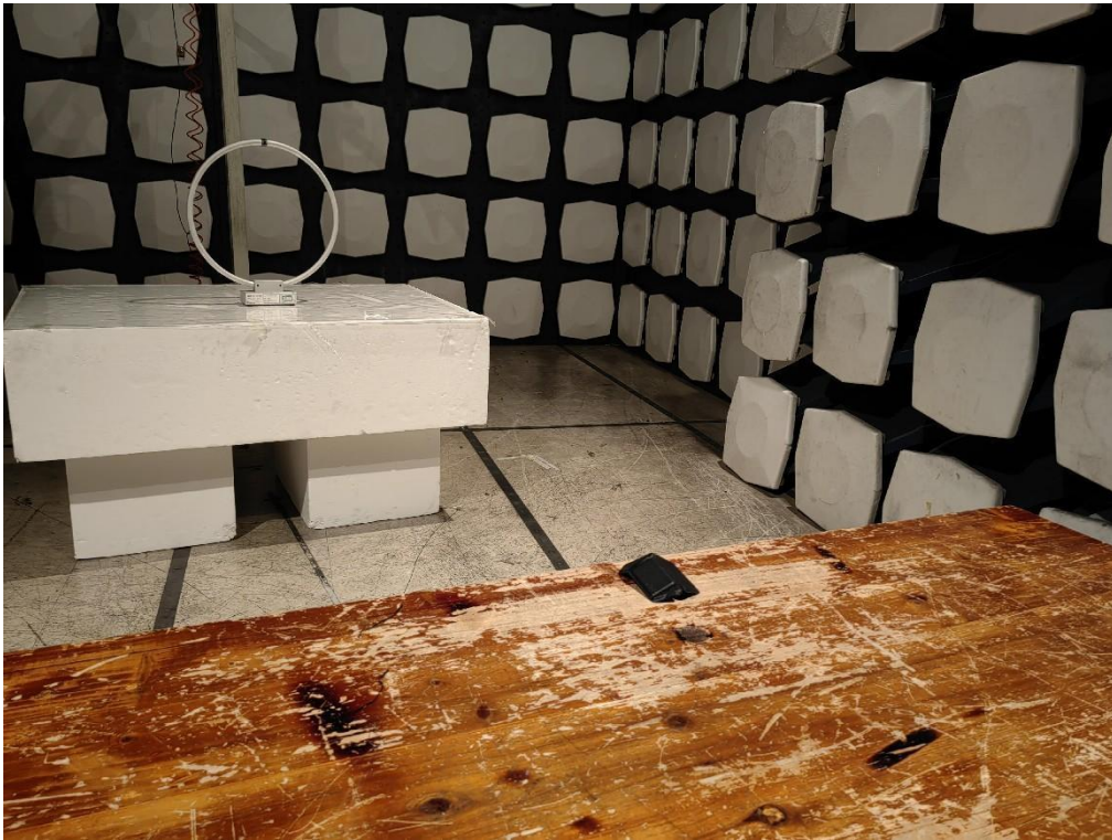
9kHz to 30MHz Radiated Spurious Emissions