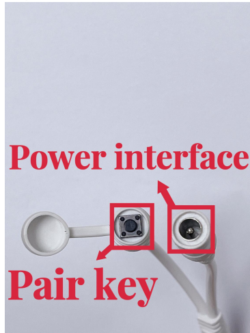
Figure 3-1 interfaces