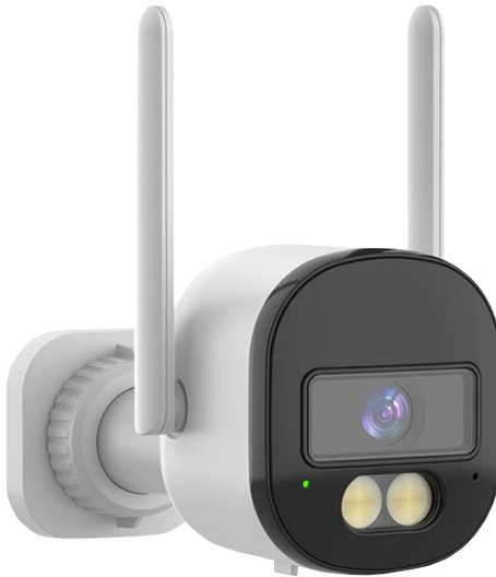
Figure 2-1 Appearance structure