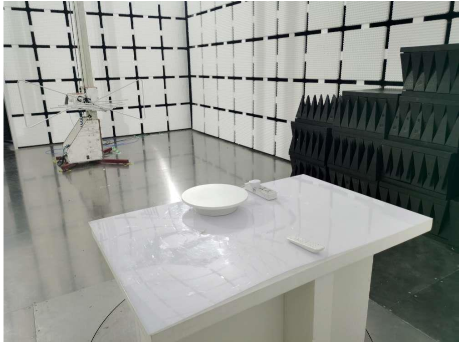
Radiated Measurement Photos