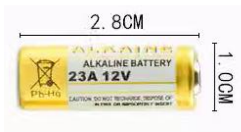
Alkaline battery Doorbell Remote control