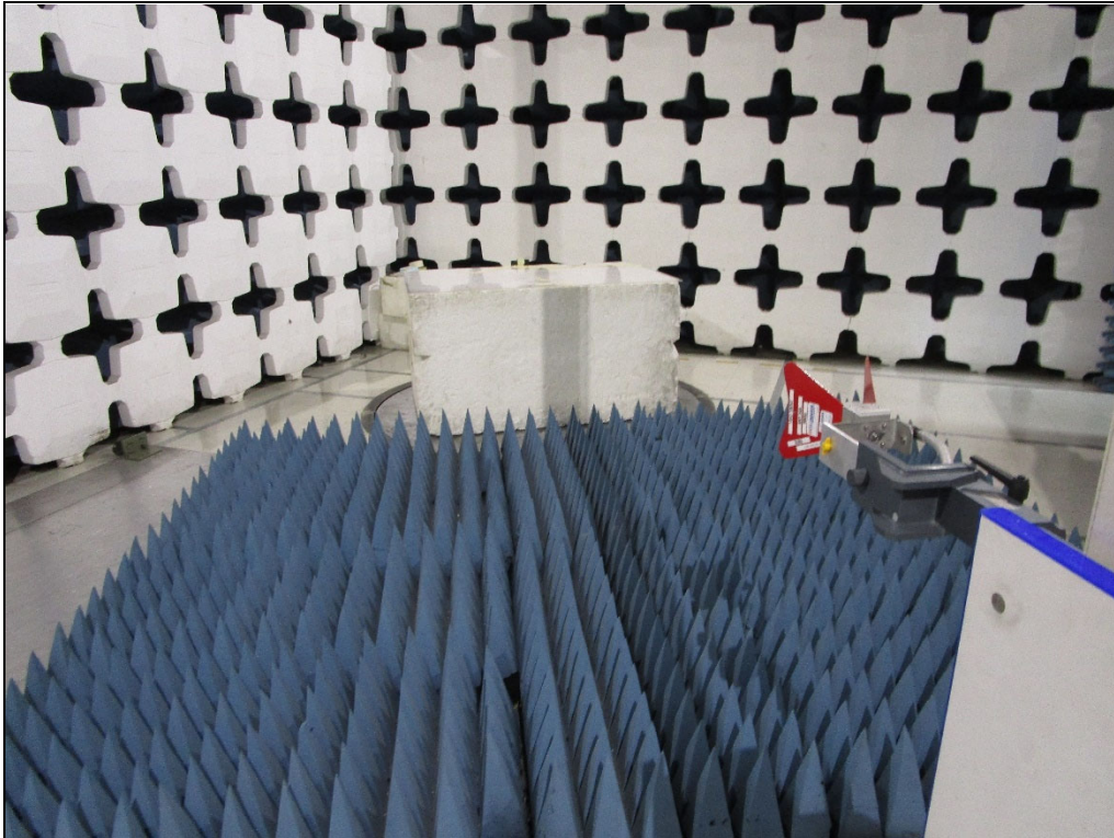
Test Setup for Radiated Emissions: Above 1GHz, Horizontal Polarization