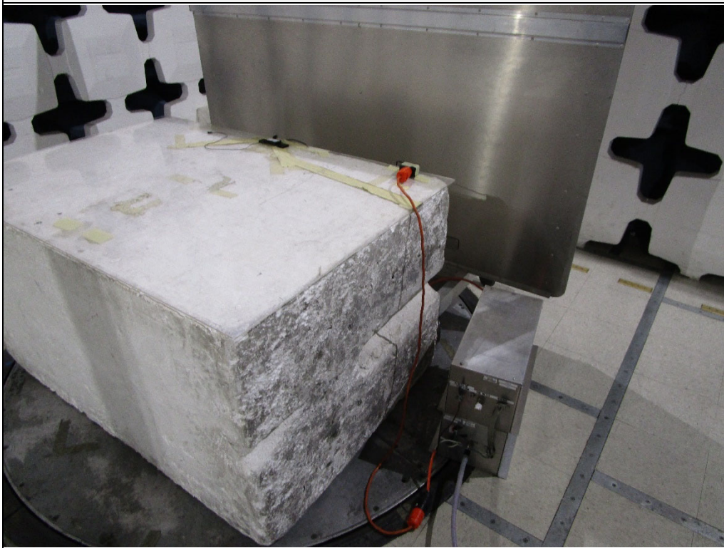
Test Setup for RF Conducted Emissions (AC Mains)