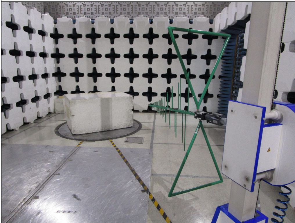
Test Setup for Radiated Emissions: 30MHz to 1GHz, Vertical Polarization