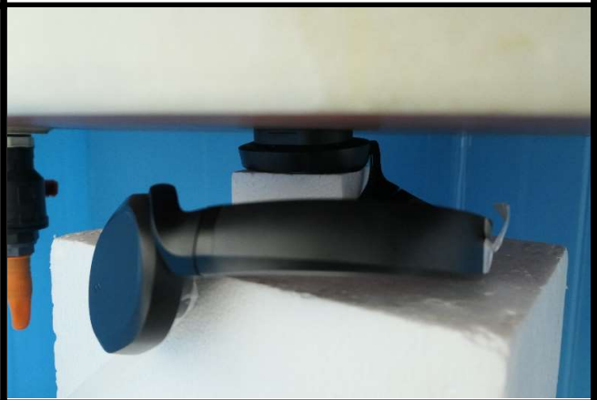
Left Ear_Sample w_o mic Mode Tested at 0 mm