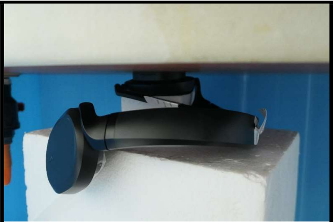
Left Ear_Sample with mic Mode Tested at 0 mm