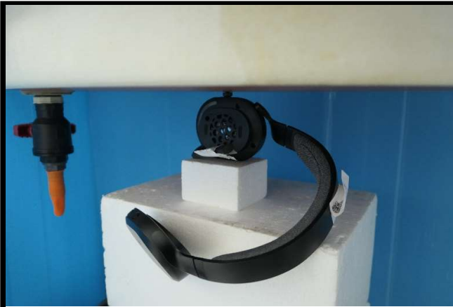
Rear Face_Sample with mic Mode Tested at 0 mm