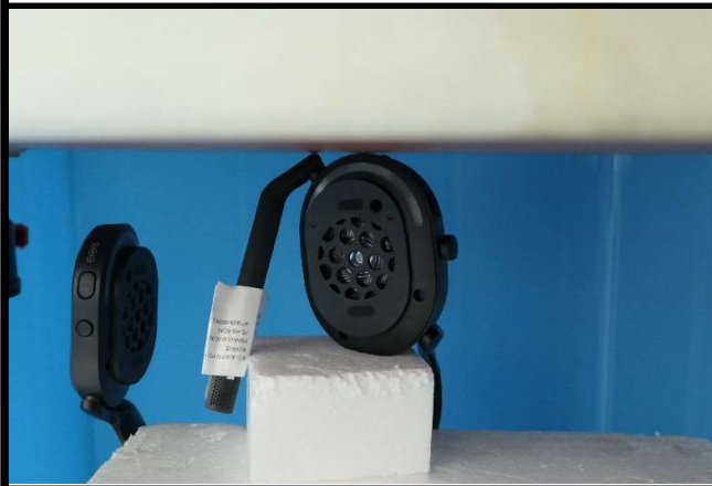
Bottom Side_Sample with mic Mode Tested at 0 mm