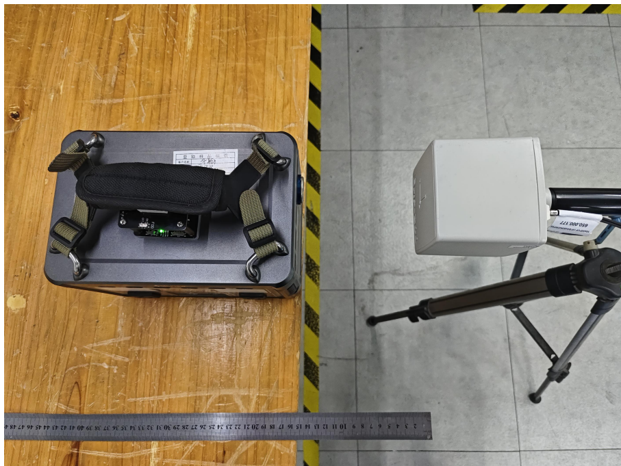
Test Position D-15cm from the edge of EUT to the geometric center of the probe