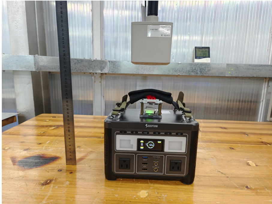
Test Position E-15cm from the edge of EUT to the geometric center of the probe