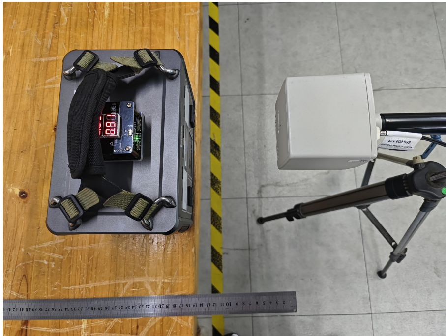
Test Position A-15cm from the edge of EUT to the geometric center of the probe