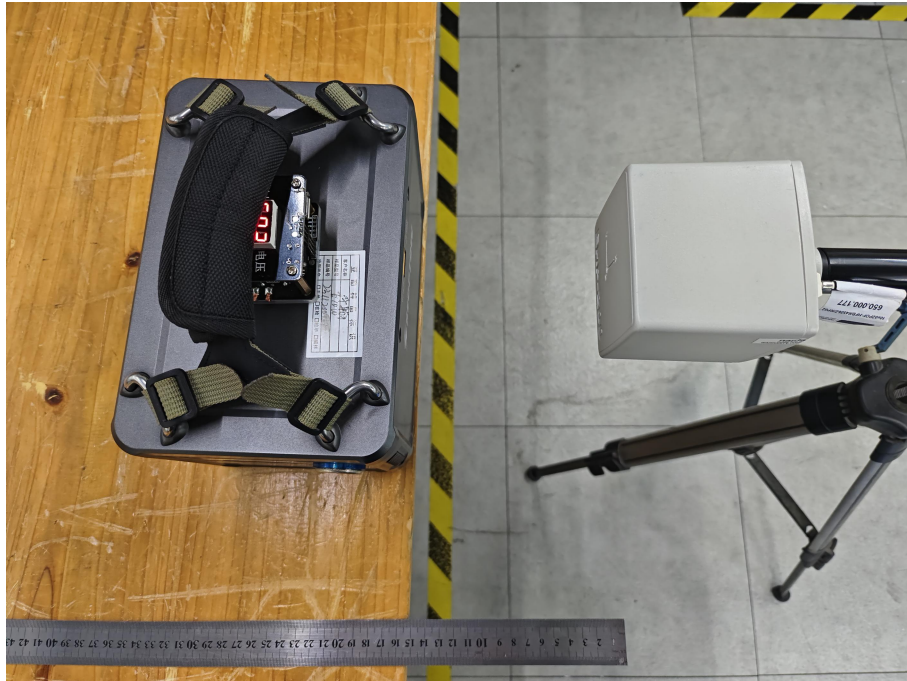
Test Position C-15cm from the edge of EUT to the geometric center of the probe