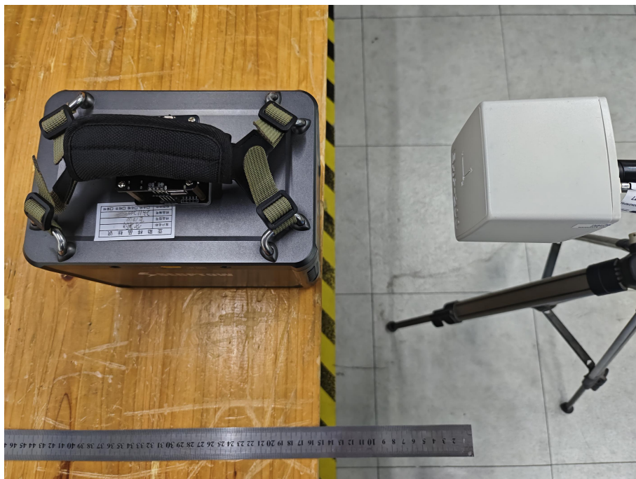
Test Position B-15cm from the edge of EUT to the geometric center of the probe