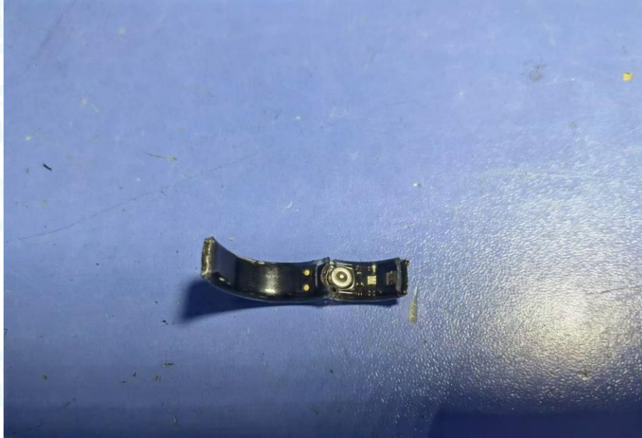
Photo 10 Appearance of PCB