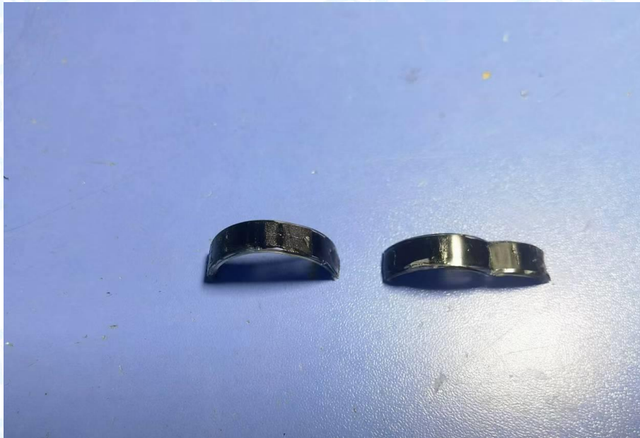
Photo 8 Appearance of Battery