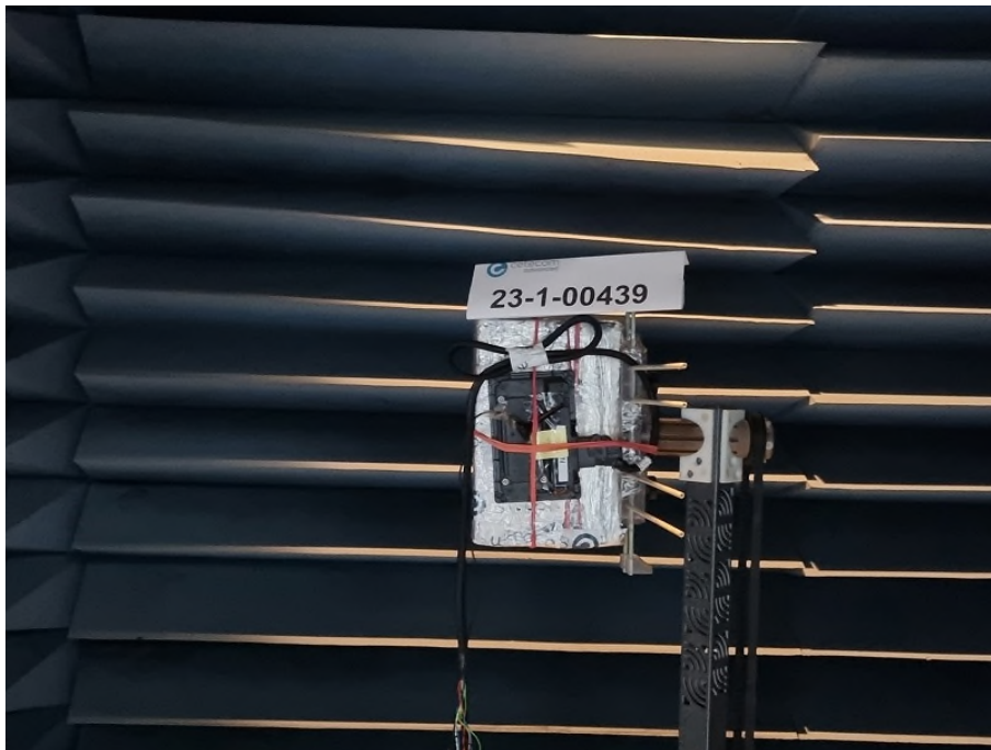
Photograph 4 : Measurements > 1GHz in FAC, close up view