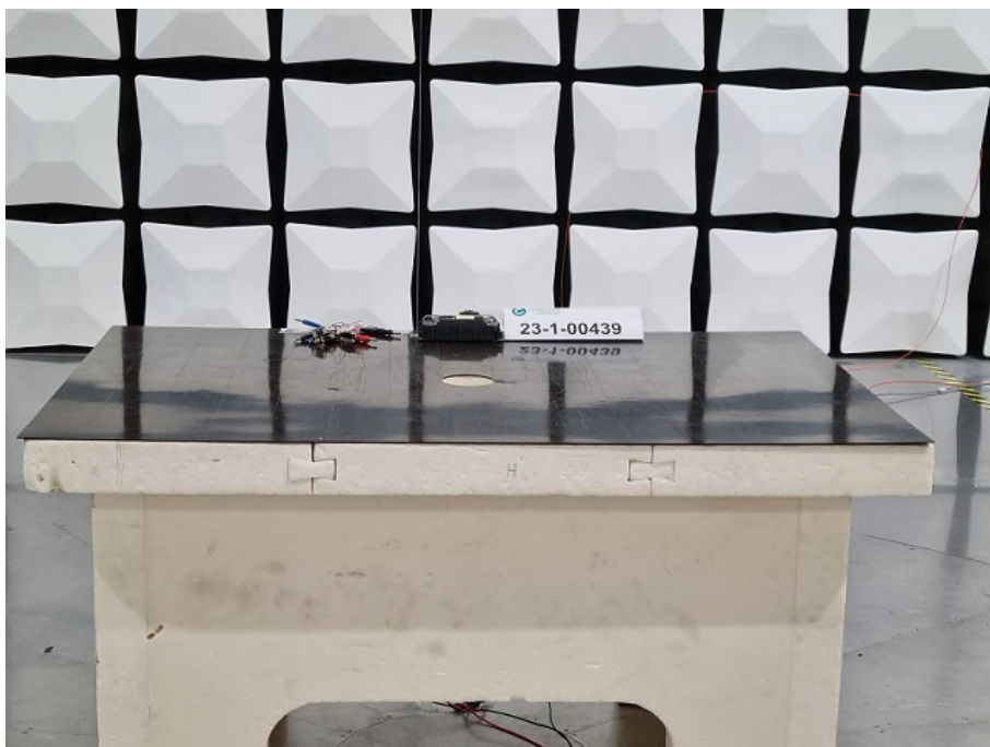
Photograph 2 : Measurements < 1GHz in SAC, close up view