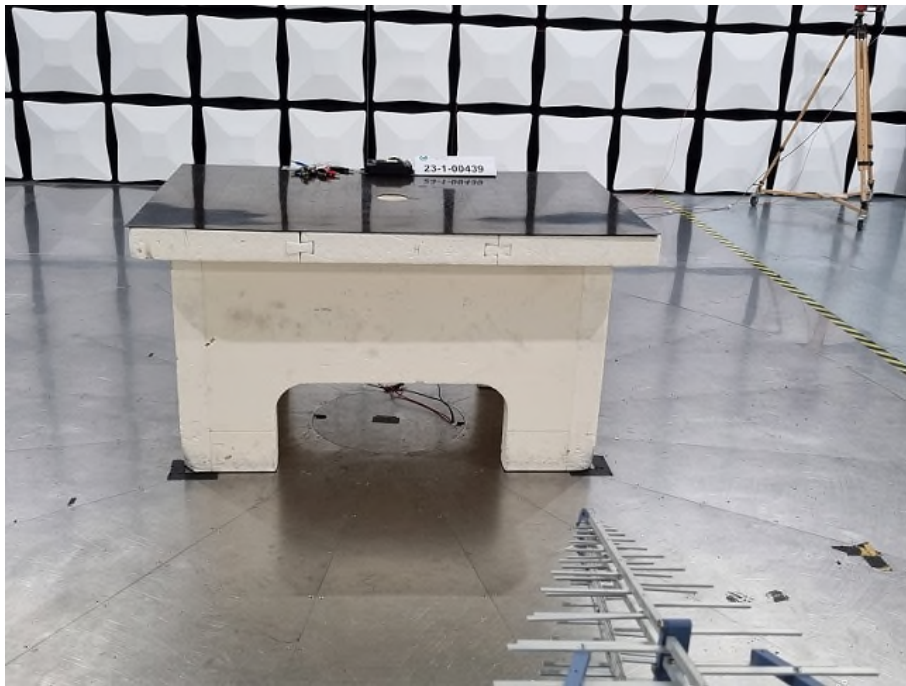
Photograph 1 : Measurements < 1GHz in SAC, overview