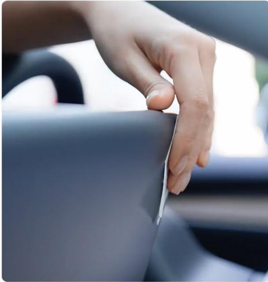
① Wet Wipes