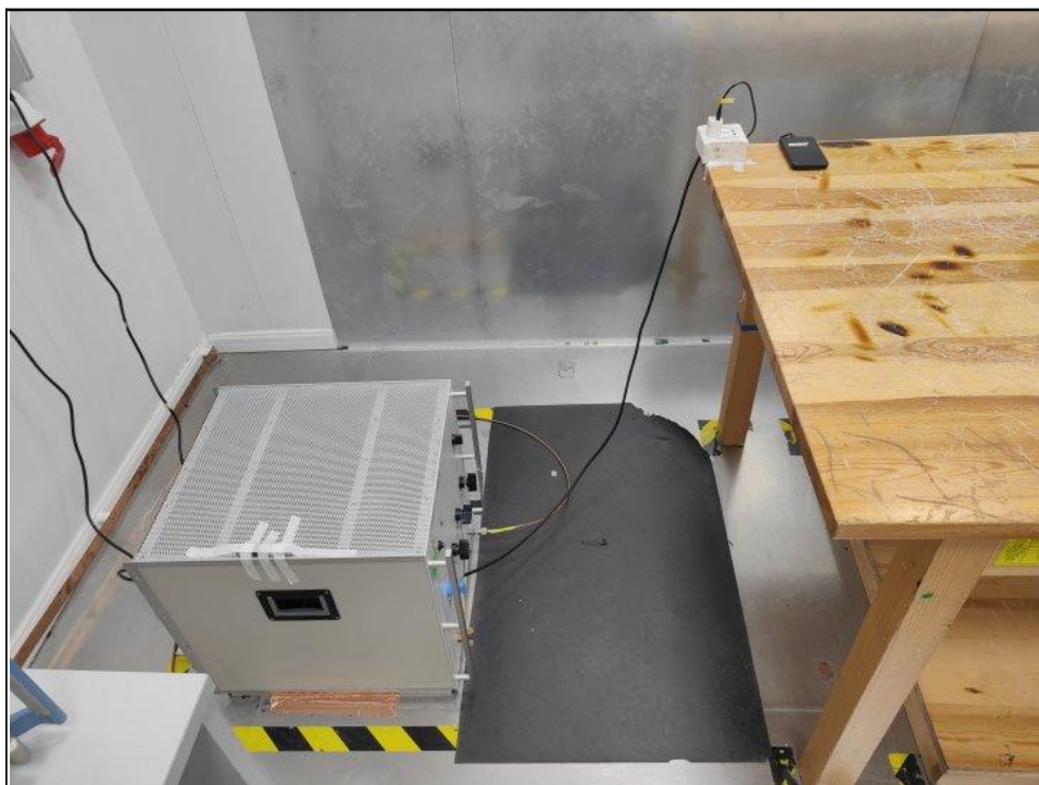
CONDUCTED EMISSION TEST