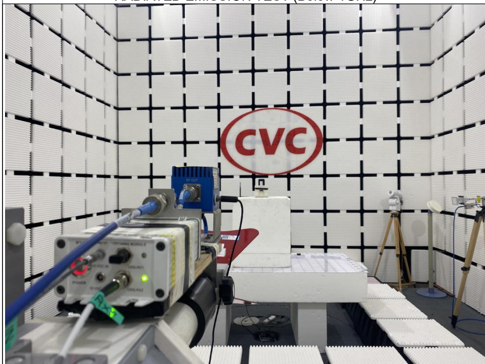
RADIATED EMISSION TEST (Above 1GHz)