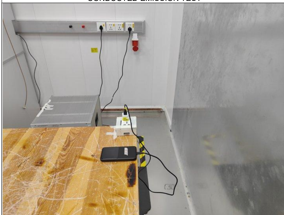
CONDUCTED EMISSION TEST