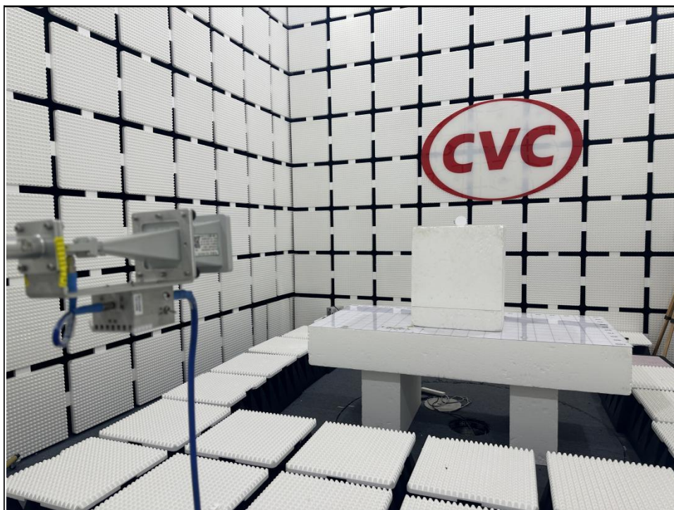
RADIATED EMISSION TEST (18GHz-40GHz)