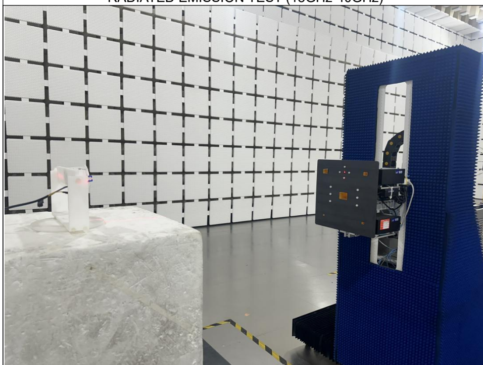
RADIATED EMISSION TEST (40GHz-200GHz)