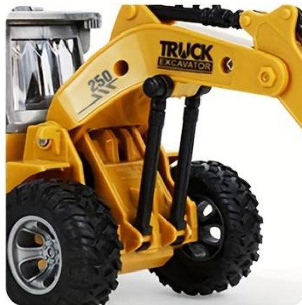
Simulated hydraulic lever