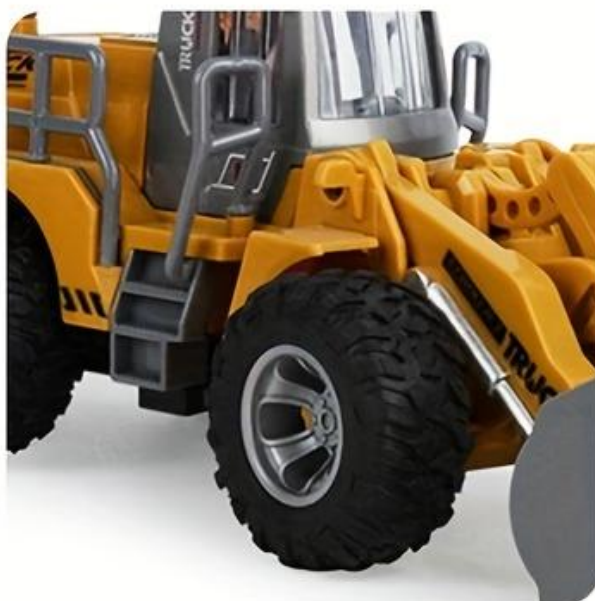
4.5cm cross-country tyre