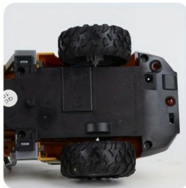
The power switch