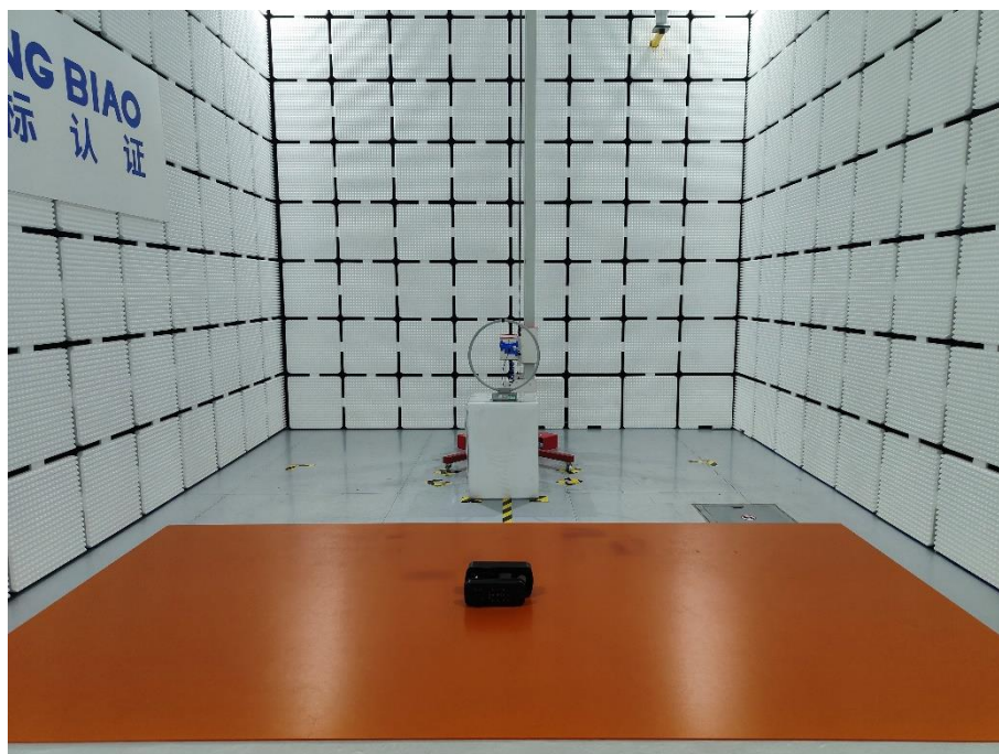
Radiated Emission Below 1GHz