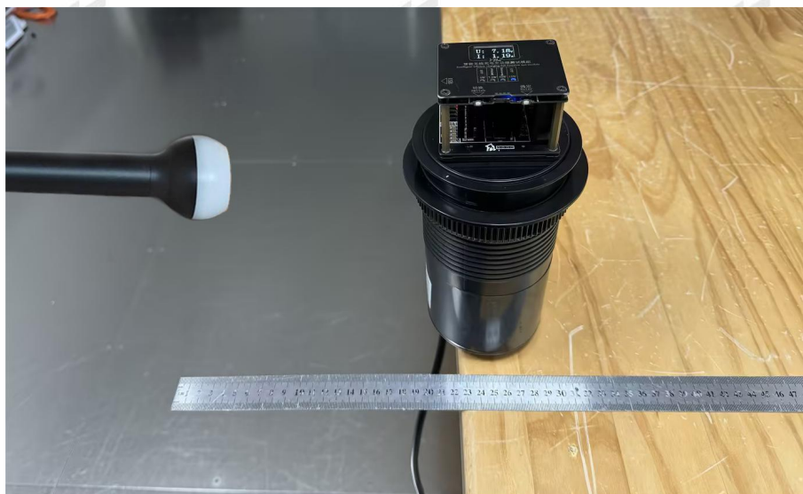
Test Set-up Photo