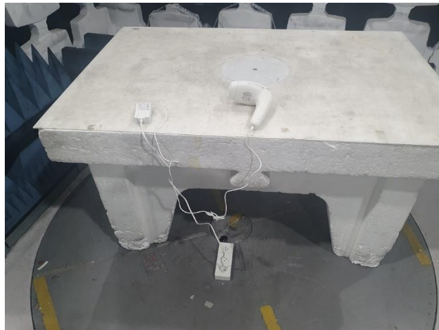
Picture 1 Radiated spurious emission test setup below 1GHZ.