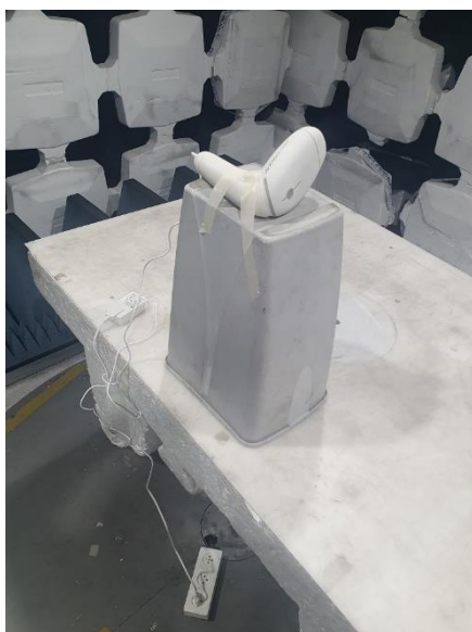
Picture 2 Radiated spurious emission test setup above 1GHz.